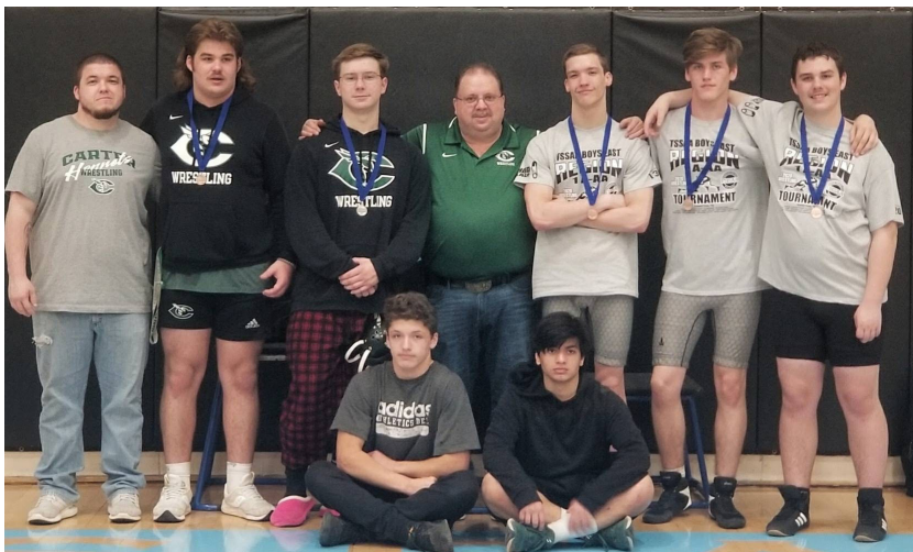
Above: These members of the CHS wrestling team made the all male 2019 state qualifiers last year.